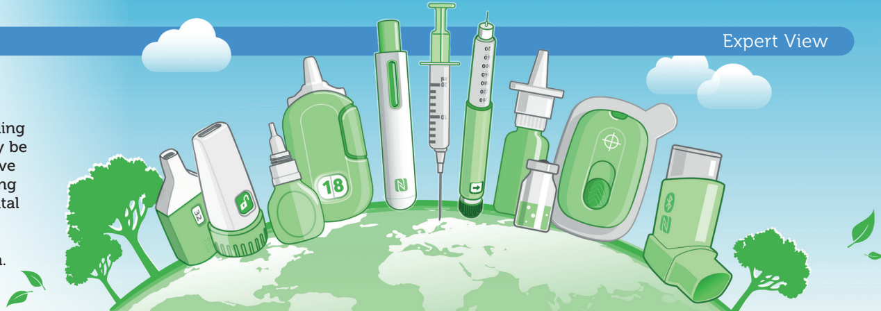
Figure 3: Extending product life may be the most effective path to improving the environmental profile of drug delivery devices in the near term.

“By good design, there is no reason why more sustainable drug delivery devices cannot also be more cost effective and better for patients.”