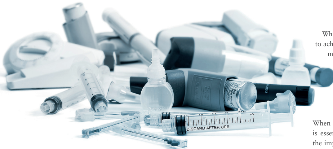
Figure 1: Single-use plastics play a vital role in healthcare.

“Greener” alternatives are being developed, with at least two major players – AstraZeneca and Chiesi – recently announcing a commitment to develop pMDIs with near-zero global warming potential. This is one example of the steps our industry is taking, but further substantial actions will be needed and we must all start to plan for and develop more sustainable drug delivery systems.